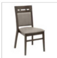
Sussex Side Chair