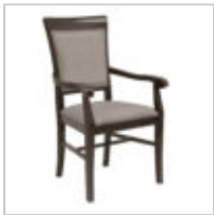
Remy Arm Chair