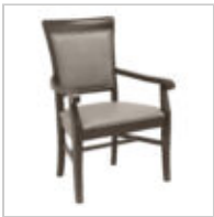
Remy Bariatric Arm Chair