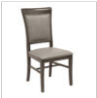
Remy Side Chair