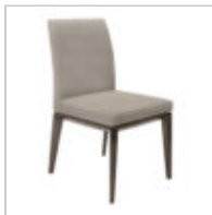
Palmanova Side Chair