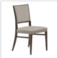
Newcastle Side Chair