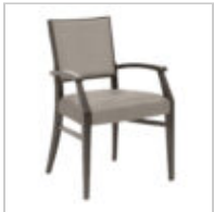
Newcastle Arm Chair