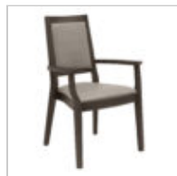
Dallas Stacking Arm Chair