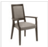
Dallas Accent Arm Chair