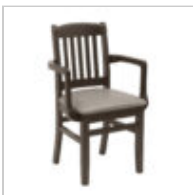
Bulldog Arm Chair