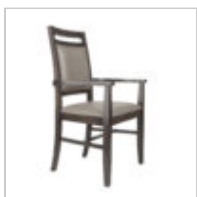
Alta Arm Chair