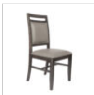
Alta Side Chair