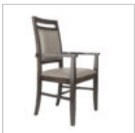
Alta Arm Chair