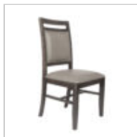
Alta Side Chair