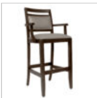
Alta Barstool with Arms