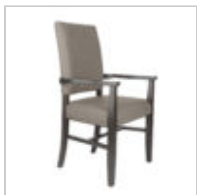
Alta Accent Arm Chair