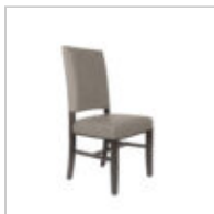
Alta Accent Side Chair